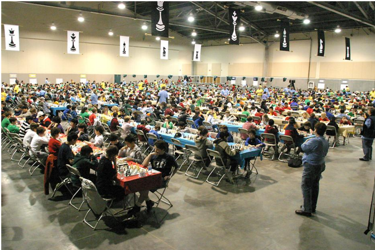
2007 Washington State Elementary Chess Championship in Vancouver

Vancouver is proud of the new Exhibition Hall at the Clark County Fairgrounds. The Exhibition Hall is a large building providing up to 97,200 sq. ft. of space that can be divided into three sections. The large area provides ample room for the 1000+ kids that enjoy playing in the state tournament (in 2007 we had 1231 participants plus 56 in I Love Chess Too!). Having the three sections under one roof will provide separation of the team tables and fun areas from the playing area. Everything will be in close proximity.